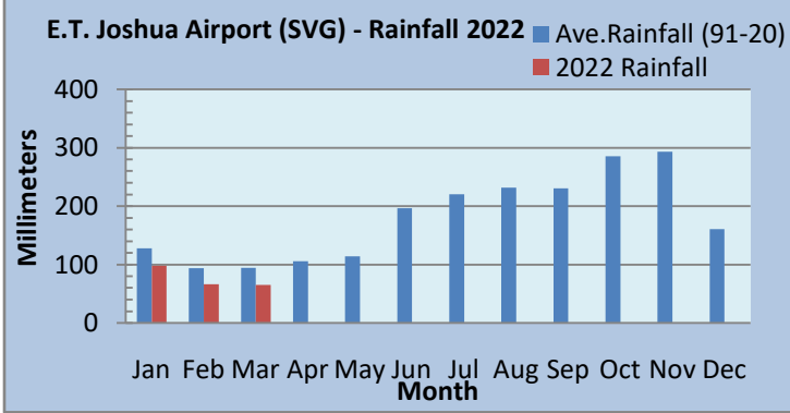
Table 1&2 March, 2022 Rainfall across SVG

The highest maximum temperature 29.4°C was recorded on the 27<sup>th</sup>, while the lowest minimum temperature value of 19.8°C was recorded on the 13<sup>th</sup>. Average maximum temperature was 28.4°C and Average minimum temperature was 21.5°C. Average daily mean temperature was 25.0°C.