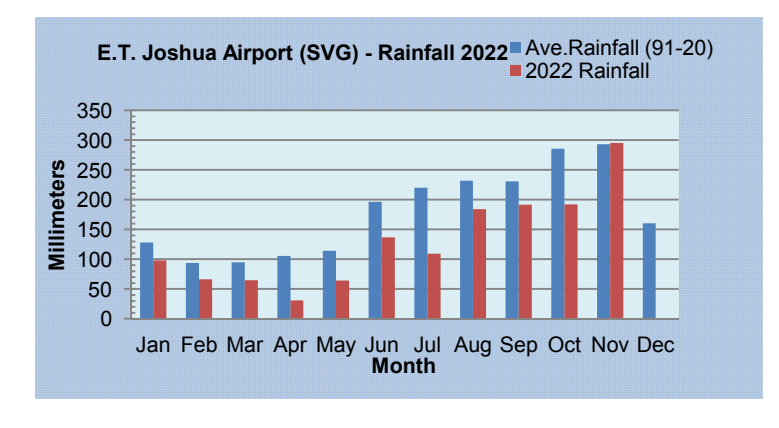
Tables 1&2: November, 2022: Rainfall across SVG.

The highest maximum temperature 30.9 was recorded on the 7<sup>th</sup>, while the lowest minimum temperature value of 19.8°C was recorded on the 2<sup>nd</sup>. Average maximum temperature was 29.0 °C and Average minimum temperature was 22.1 °C. Average daily mean temperature was 25.5 °C.