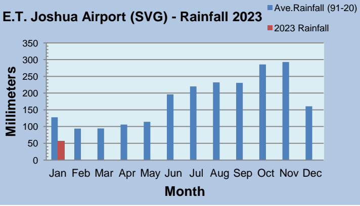
Tables 1&2: January, 2022: Rainfall across SVG.

The highest maximum temperature 29.5°C was recorded on the 14^{th} , while the lowest minimum temperature value of 19.5 °C was recorded on the 27^{th} . Average maximum temperature was 28.0 °C and Average minimum temperature was 21.4 °C. Average daily mean temperature was 24.7 °C.