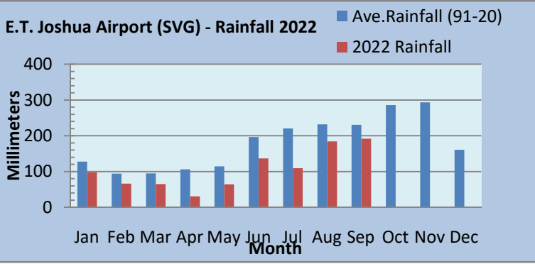
Table 1&2 September, 2022 Rainfall across SVG

The highest maximum temperature 32.3°C was recorded on the 3<sup>rd</sup>, while the lowest minimum temperature value of 21.0°C was recorded on the 29<sup>th</sup>. Average maximum temperature was 30.4°C and Average minimum temperature was 23.3°C. Average daily mean temperature was 26.7°C.The maximum wind gust of 30 knots (~54 km/h or 33 mph) was recorded on the 23<sup>rd</sup> September.