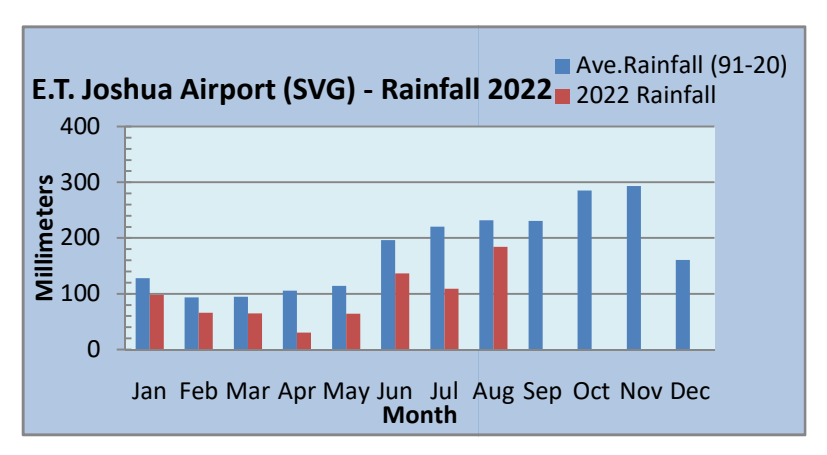
Table 1&2 August, 2022 Rainfall across SVG

The highest maximum temperature 31.3°C was recorded on the 19<sup>th</sup>, while the lowest minimum temperature value of 18.6 °C was recorded on the 30<sup>th</sup>. Average maximum temperature was 30.2 °C and Average minimum temperature was 22.7 °C. Average daily mean temperature was 26.5°C.