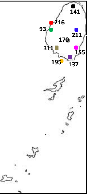
Fig 1: Rainfall Stations

HIGHLIGHTS: As we continue into the hurricane season – Be Prepared! View various bulletins and outlooks. View various bulletins and outlooks issued by the Caribbean Regional Climatic Centre (Health, Agriculture, Heat Outlook etc.) Read the Caribbean Agro-Climatic bulletin of CarISAM and other national bulletins.